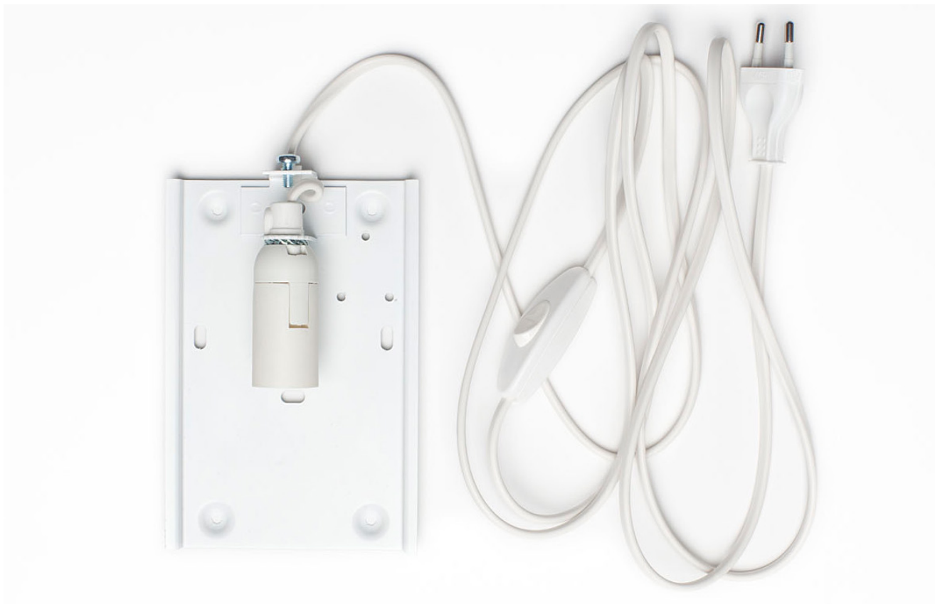
Standard back plate inside (above) Standard back plate outside (below)