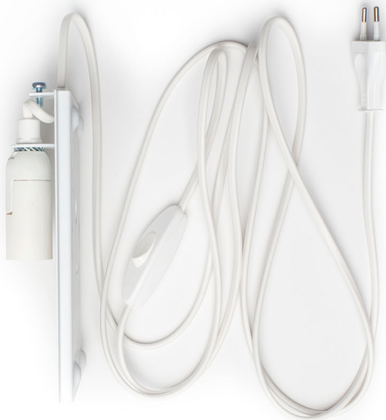
Standard back plate profile (above) Wall mount back plate version (below)