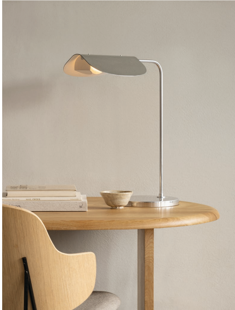
WING TABLE LAMP Designed by Kenneth Bergenblad