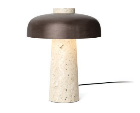
REVERSE TABLE LAMP, BRONZED BRASS 1410619Y

The Reverse Table Lamp is sold included five interchangeable plugs suitable for North America, Australia, China, Europe and the UK.