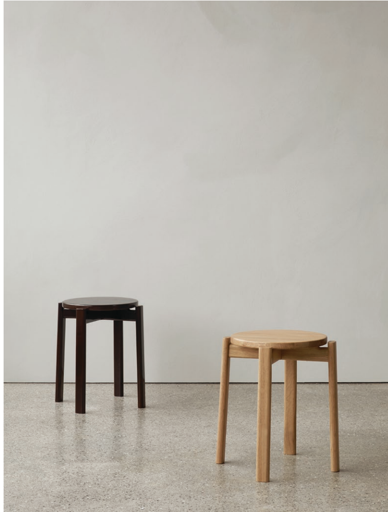
PASSAGE STOOL Designed by Krøyer-Sætter-Lassen