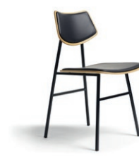
Seat and back offset upholstery