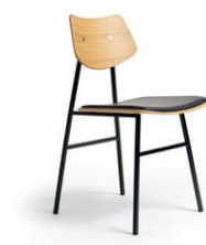
Seat offset upholstery