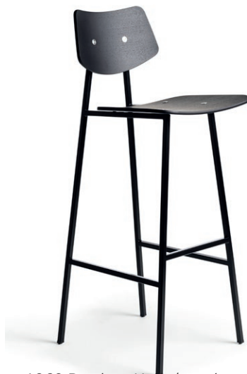
1960 Barchair High (seat height 75cm)