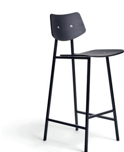
1960 Barchair Low (seat height 65cm)